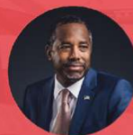
Dr. Ben Carson Founding Honorary National Chairman