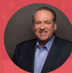
Mike Huckabee Honorary National Chairman